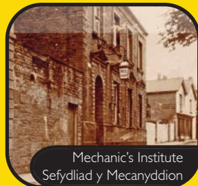
Mechanic's Institute Sefydliad y Mecanyddion

If you would like this leaflet in larger font or in an alternative format, please contact the Tourism Team on 01639 686088.